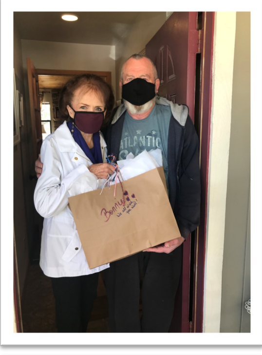
March 2, 2021

A "SPECIAL MESSAGE" to the Ladies of the Quilt Guild